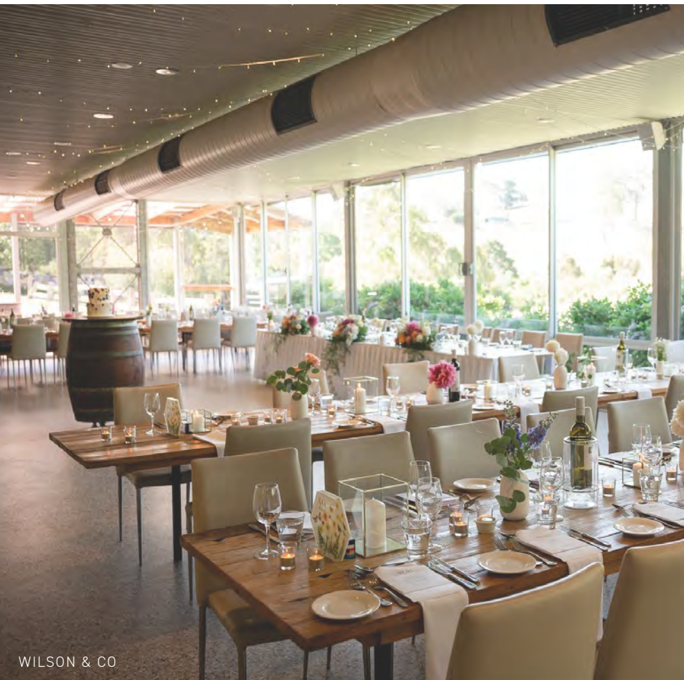
WILSON & CO